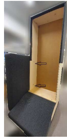
2. 2 Polti/2 pultti/2 bolts

1. Includes: 4 part, 12 bolts, 4 nuts, 4 washer, 1 plastic leg