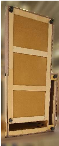
3. 2 polti/2 puliti/2 bolts