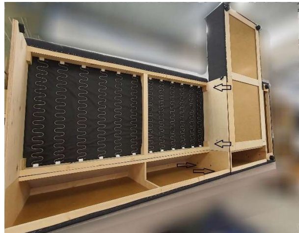
4. 4 Polti,4 mutrit, 4 seibi/4 pulttia,4 mutteria,4 aluslevy