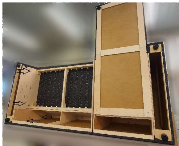
5. 4 polti/4 pultti/4 bolts