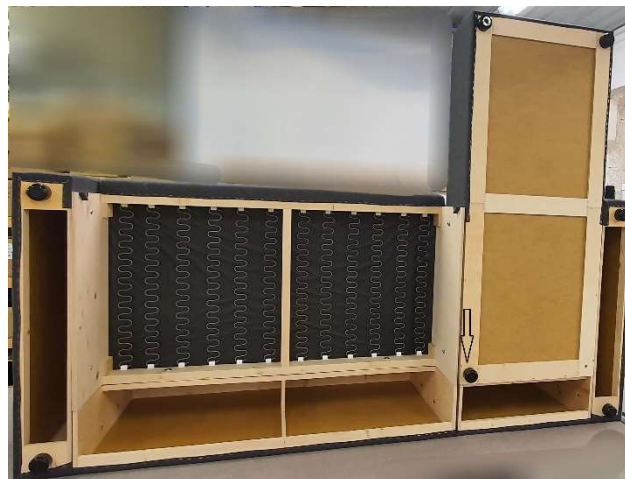
6. Plastikjalg vastavalt nurgale (pildil parem nurk)

Plastic leg according to a corner right corner in the picture