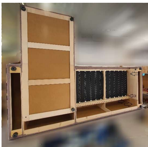
5. 4 polti/4 puliti/4 bolts