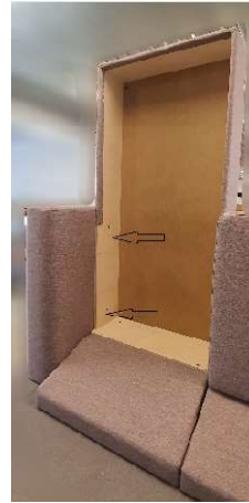
2. 2 Polti/2 puliti/2 bolts

1. Includes: 4 part, 12 bolts, 4 nuts, 4 washer, 1 plastic leg