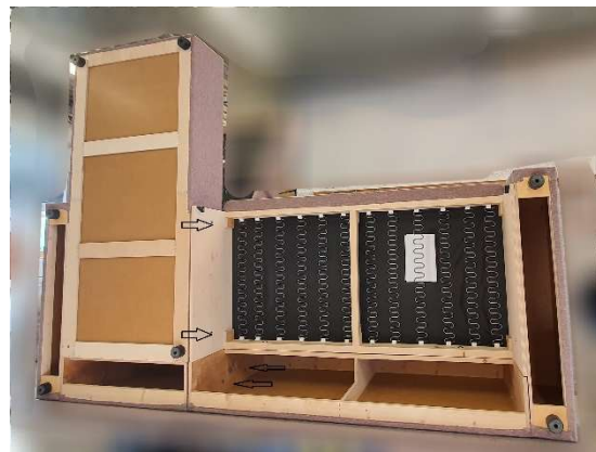
4. 4 Polti,4 mutrit, 4 seibi/4 pulittia,4 mutteria,4 aluslevy