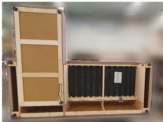
6. Plastikjalg vastavalt nurgale (pildil vasak nurk)

Plastic leg according to a corner (left corner in the picture)