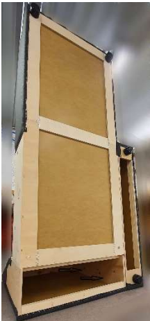
3. 2 polti/2 pultti/2 bolts